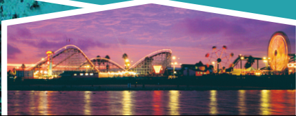
1 SANTA CRUZ BEACH BOARDWALK 400 BEACH STREET, SANTA CRUZ The Boardwalk serves as a backdrop for the film.