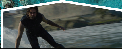
3 PLEASURE POINT EAST CLIFF DRIVE BETWEEN 35 TH & 41 ST AVENUES Frosty surfs Pleasure Point.